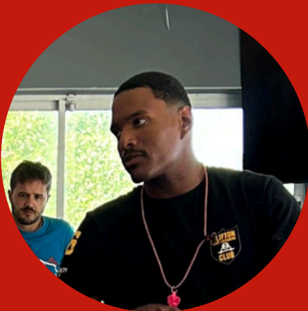
Ridaah Surf Instructor (In-Training)