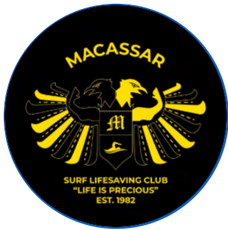
Macassar Surf Lifesaving Club