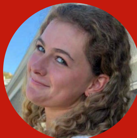
Moune Surf Instructor (In-Training)